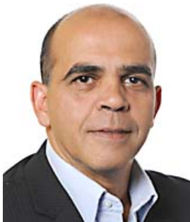
Kader Arif (FR)